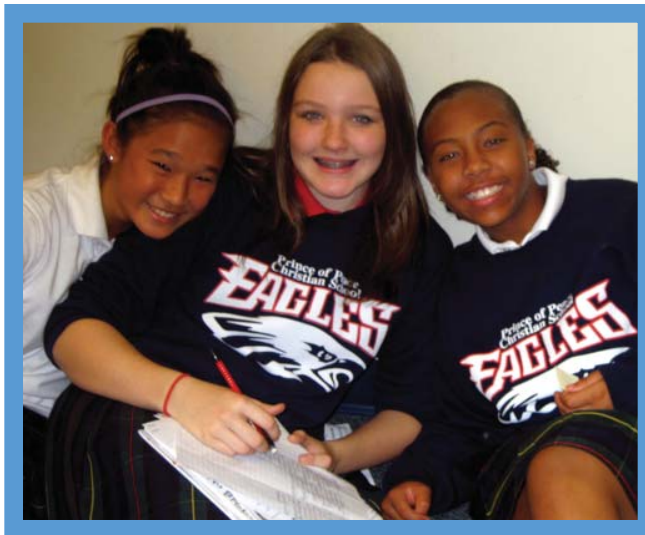
Prince of Peace Christian Middle School